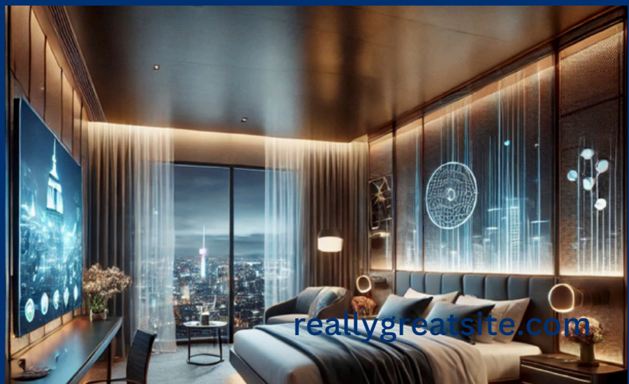
Photo description: A luxurious hotel room with advanced technology features. The room has a sleek, modern design with ambient lighting, a large smart TV embedded in the wall, a digital touchscreen control panel for lighting and temperature, voice-activated smart assistants, and motorized curtains. The bed is king-sized with premium bedding, and there is a futuristic workstation with a transparent OLED display. A city skyline view is visible through floor-to-ceiling windows.

Ultimately, we concluded that a one-size-fits-all approach to technology did not work. By aligning offerings with generational preferences, hotels can enhance guest satisfaction, optimize spending on technology, and differentiate themselves in a competitive market."