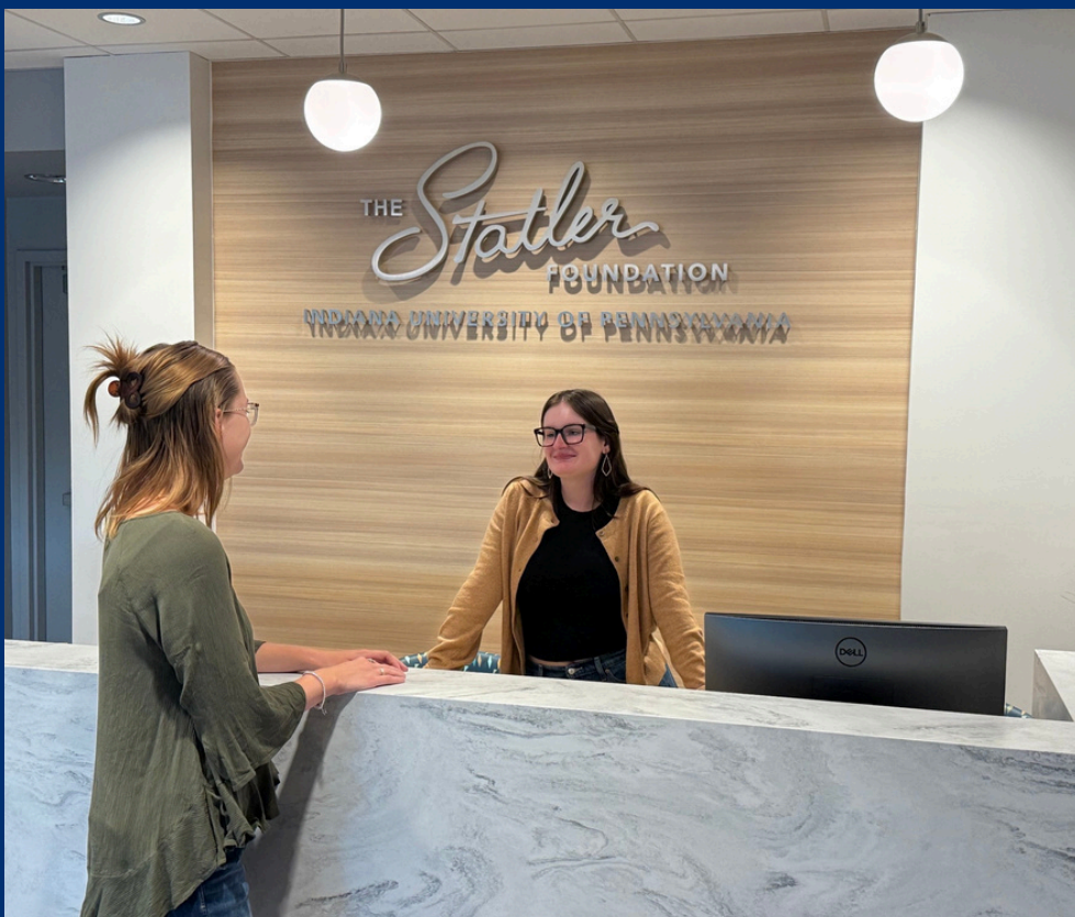
Indiana University of Pennsylvania students at their hotel simulation desk , funded by The Statler Foundation

In 2024 , the Foundation awarded scholarships to students attending Buffalo State University, Cornell University, The Culinary Institute of America, University of Denver, Florida International University, Indiana University of Pennsylvania, Johnson & Wales University, Mercyhurst University, Michigan State University, Niagara University, Paul Smith's College, Pennsylvania State University, Purdue University, Rochester Institute of Technology and University of South Carolina.