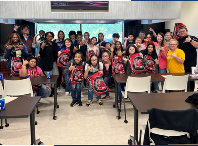
2023 Cohort of students

The Statler Foundation Program to Increase Youth Access to Hotel Education and Careers at the University of South Carolina has been an important initiative in providing underrepresented and underprivileged high school students (grades 9–12) in South Carolina with access to hotel education and potential career pathways within the hospitality industry. The program aims to reach students who may not have previously considered pursuing a college degree or exploring careers in hotels and hospitality.