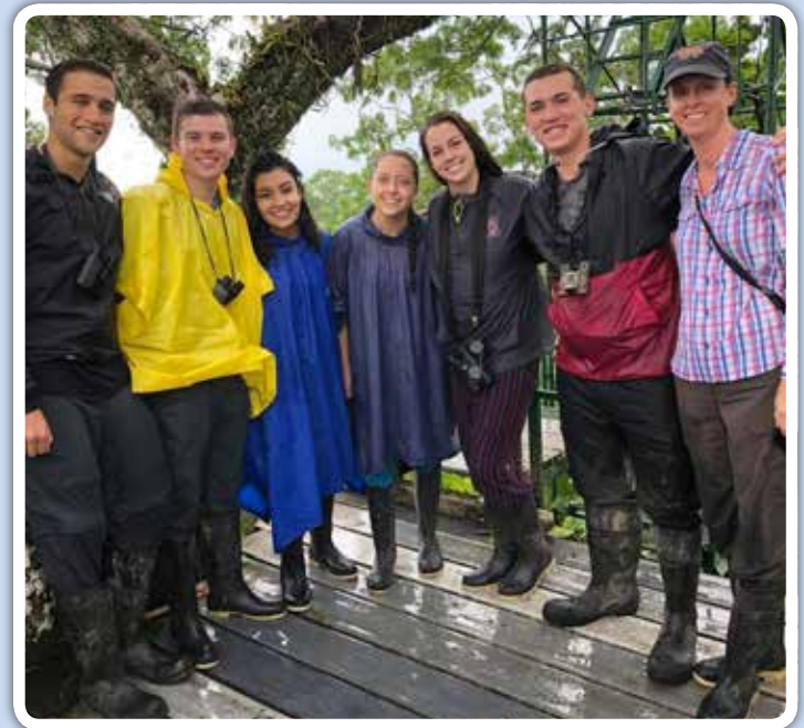
University of South Carolina’s Hospitality, Retail and Sports Management Department students – Galapagos Study Abroad trip

“We learned from each other. Tons of different people from different backgrounds, and we’re all discussing tourism and sustainability. You get so many different viewpoints and learn in so many different ways. It was a life-changing experience.”