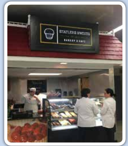
Statler’s Sweets Bakery and Café, located at the ECC North campus.

The Hospitality Management Department/North Campus would like to extend its sincere appreciation to The Stater Foundation for their ongoing support and valuable assistance. As a direct result of their efforts, SUNY Erie’s Baking and Pastry Arts Certificate Program is able to provide students with an outstanding educational opportunity, allowing them to gain the knowledge and skills needed to succeed in the hospitality industry’s ever-growing and popular baking sector.