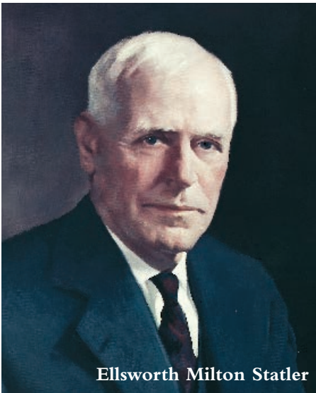
Ellsworth Milton Statler