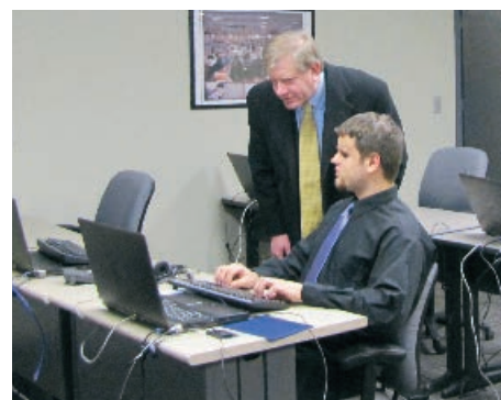
Visually-impaired students are prepared for jobs in the hospitality industry with hands-on experience.

The Statler Center remains grateful for the belief that The Statler Foundation has in the ability of disabled individuals, and for its willingness to support the training and placement efforts of the Center. On behalf of every graduate our program has produced, we thank you.”