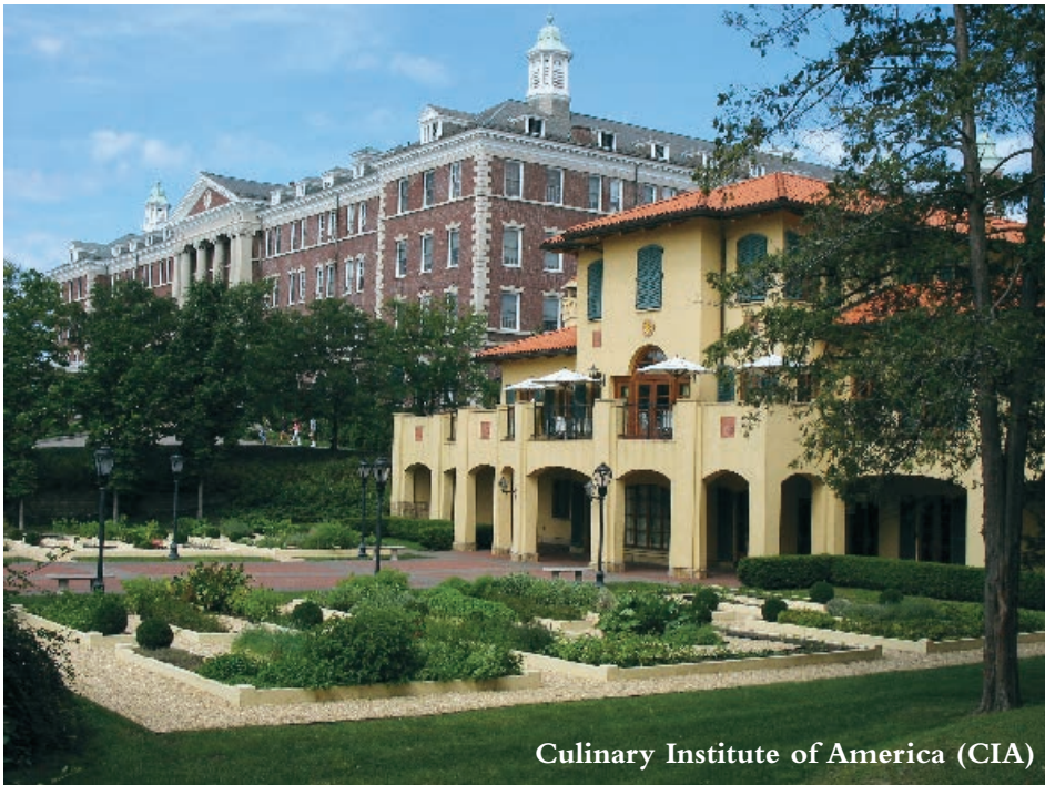
Culinary Institute of America (CIA)