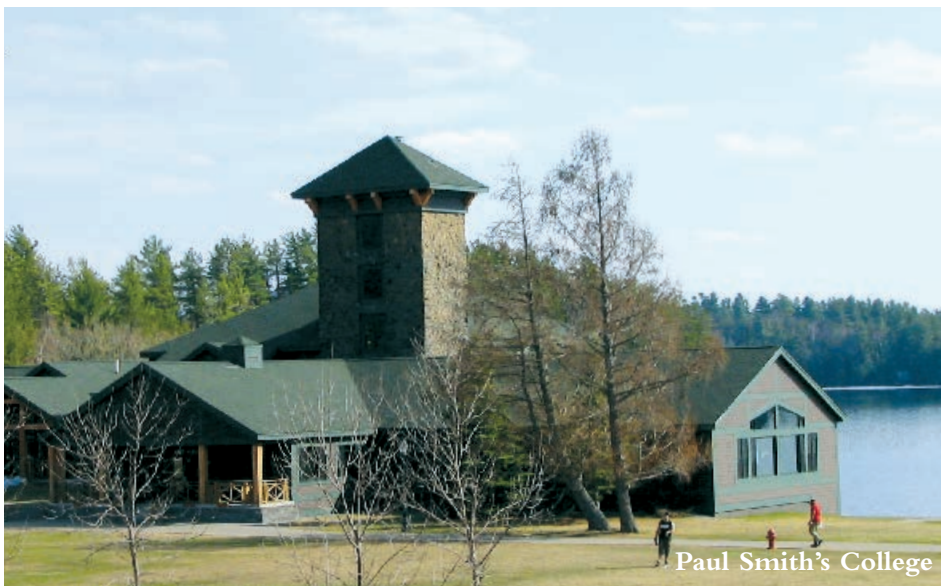
Paul Smith's College

The FIU Hospitality Review has provided a forum for hospitality faculty and industry leaders from around the world to present research and commentary and serves as a dynamic resource for students, faculty and industry executives. Thousands of students have benefited from the technologically advanced Statler Distance Learning Classroom that has given the School the capability to transmit hospitality classes to multiple distance sites.”