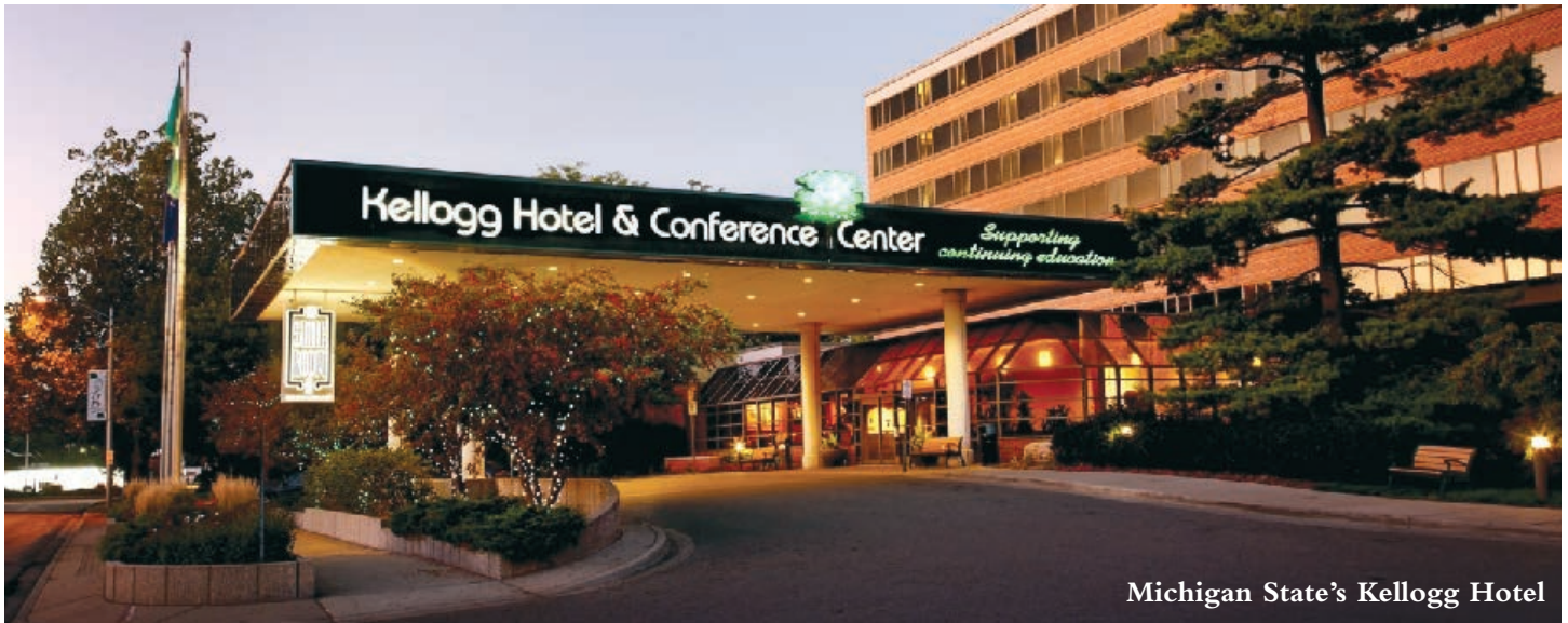
Michigan State's Kellogg Hotel